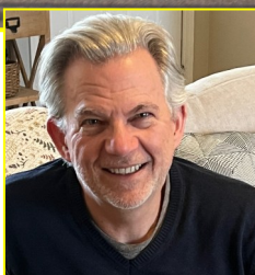
BY KEVIN GUIGOU CFFM ASSOC. PASTOR

The Bible describes the Christian life as a race that not only calls for power, but also perseverance, persistence, and patience. Too often, we only think of the miraculous power of the Holy Spirit as being instantaneous. More often, we need God’s daily strength just to walk steadfastly in God’s love, peace, longsuffering, etc. Thankfully, the Spirit of God empowers bursts of energy for life’s shorter sprints, as well as supernatural stamina over the long run of faithfulness.